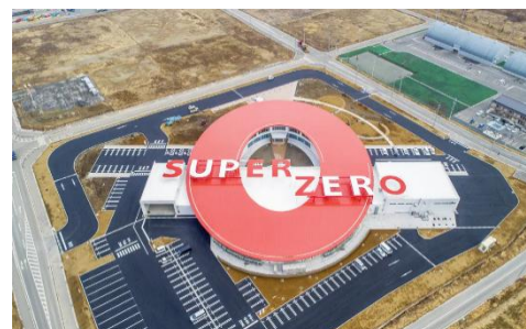
Super Zero Yarn Twisting Factory

The company is also turning its attention to the fashion apparel sector. It will showcase fabrics and finished products such as denim using Super Zero as the weft yarn, and 100% wool knits made with Super Zero. The denim is produced in cooperation with partner factories in Okayama Prefecture.