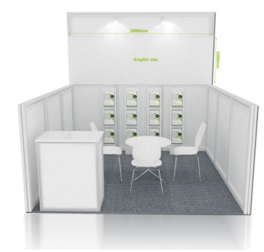
*Design layout for reference only