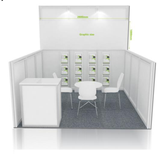
*Design layout for reference only