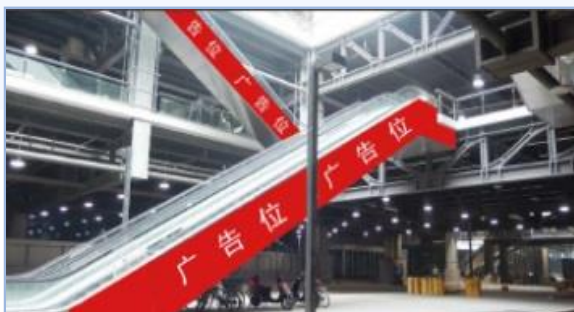
C04 Escalator advertisement

Specification: 4m (H) x 8m (W) Price: USD 5,000 / RMB 35,000