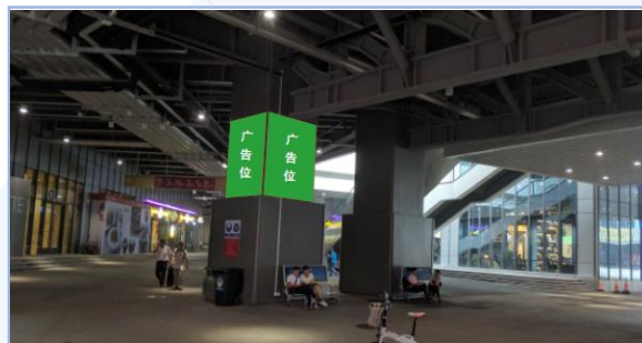
C13 Column light box advertisement (New)

Specification: 4m (H) x 12m (W) Price: USD 16,500 / RMB 115,500