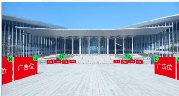
C02 Billboard - South plaza

Specification: 3m (H) x 12m (W) Price: USD 5,500 / RMB 38,500