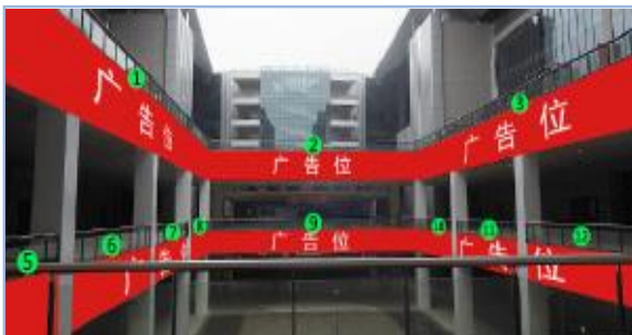
C07 Hanging banner -Skylight at East / West esplanade

Specification: (a) W6: 3.3m (H) x 17m (W) (b) W3: 2.8m (H) x 17m (W) (c) E2/E6/E9: 2.8m (H) x 16m (W) (d) Others: 2.8m (H) x 11m (W)