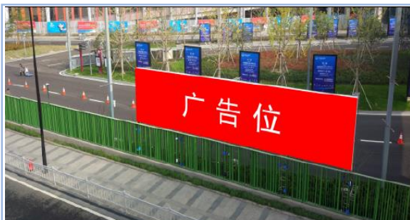
C01 Billboard - Main entrance (External)

Specification: 3m (H) x 12m (W) Price: USD 5,500 / RMB 38,500