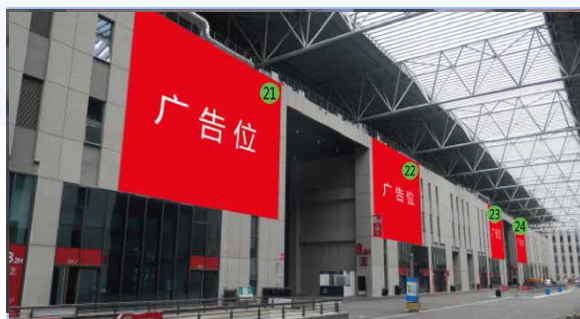
C09 Side wall advertisement on Second Floor

Specification: 2.6m (H) x 4m (W) Price: USD 1,200 / RMB 8,400