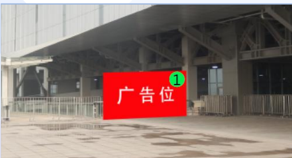
C03 Billboard - East / West registration hall entrance

Specification: 4m (H) x 8m (W) Price: USD 5,000 / RMB 35,000