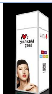
C11 Rectangular lightbox (4-sided) (New)

Specification: 5m (H) x 12m (W) Price: USD 11,300 / RMB 79,100