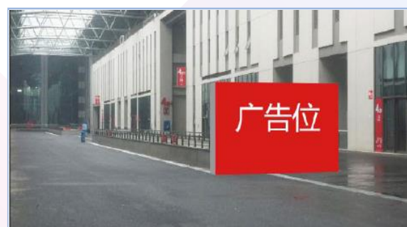
C06 Billboard at Skylight on Second Floor

Specification: 2.2m (H) x 4m (W) Price: USD 1,400 / RMB 9,800