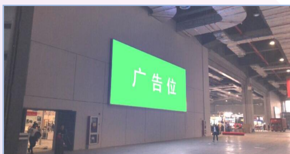
C10 Light-box on hall partition (New)

Specification: 10.8m (H) x 14m (W) Price: USD 24,000 / RMB 168,000