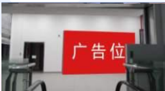
C08 In hall escalator advertisement on Ground Floor

Price: (a) W6: USD 8,500 / RMB 59,500 (b) W3: USD 7,200 / RMB 50,400 (c) E2/E6/E9: USD 7,000 / RMB 49,000 (d) Others: USD 4,800 / RMB 33,600