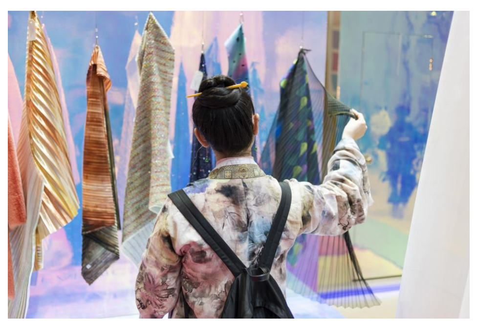
Trend forums visualise upcoming fashions with exhibitors' fabric samples

As Intertextile Shanghai Apparel Fabrics celebrates its 25<sup>th</sup> anniversary later this month, the fringe programme will focus on three key topics that shape the future of apparel and the textile trade industry. Design trends, technology and sustainability will be the key themes over the fair's three days, featuring Shanghai's first ever FASHIONSUSTAIN conference, a more comprehensive trend forum, a new Consumer Trend discussion and a special event from the Licensing China fair, which debuts in early 2020.